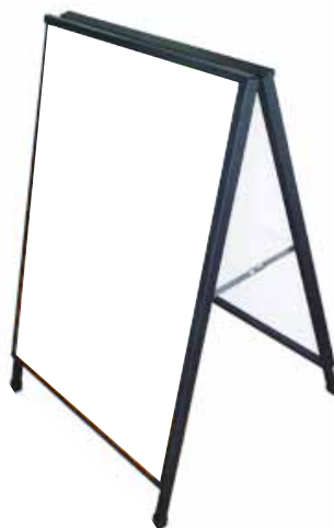
AFC - Print is applied to corflute which can be slotted in to frame