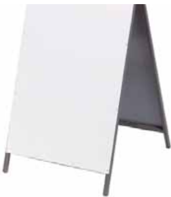
AFM - Print is applied to metal with rivets